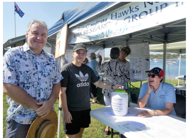
Did this family drive all the way from Darwin, just to support our Nota to Trove campaign?